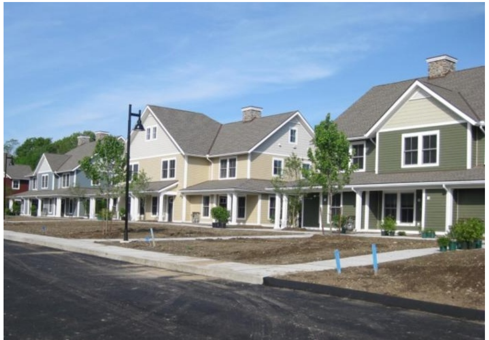
With support from CHFA's "Housing Connections" program, Old Saybrook's Ferry Crossing is providing much needed affordable housing options to shoreline families.

Each issue highlights a different community and CHFA's ongoing efforts to support the development and preservation of affordable housing in that town.