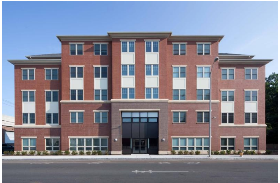
With funding from the Interagency for Supportive Housing, Gateway at 570 provides housing for previously homeless individuals with services on site.

Each issue features an exciting new development in affordable housing in Connecticut.