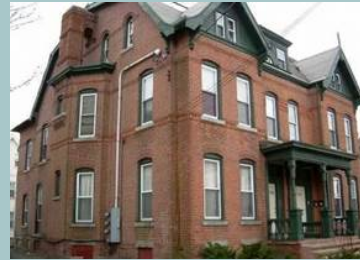
338 Grand Avenue

Investing in Connecticut's smaller multifamily buildings is a challenge, especially in cities like New Haven. By partnering with Community Development Finance Institutions (CDFIs), CHFA is able to preserve affordability in smaller multifamily developments throughout the Elm City. The CDFI Small Multifamily Loan Pool has helped lending partners like Greater New Haven Community Loan Fund (GNHCLF) make smaller developments like 338 Grand Avenue a reality.